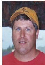
2008 Doubles CH