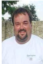
2008 12 Gauge CH