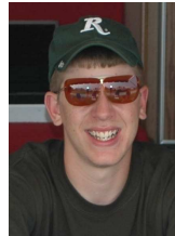
2008 20 Gauge CH